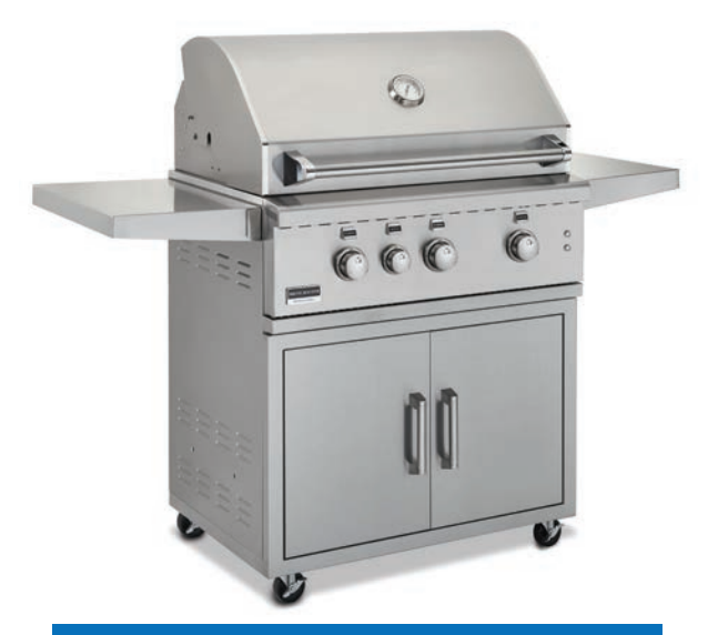
34-IN CART WITH DOORS