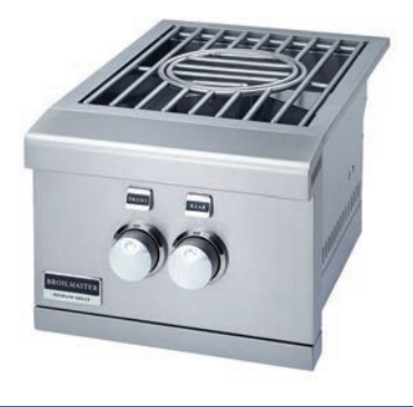
POWER BURNER, SLIDE-IN (16-IN)