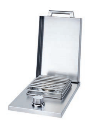
SINGLE BURNER, DROP-IN (12-IN)

Maximize your cooking space with a side burner. Choose the single burner, double burner, or power burner. For added convenience, select the roll-out waste drawer or propane tank drawer.