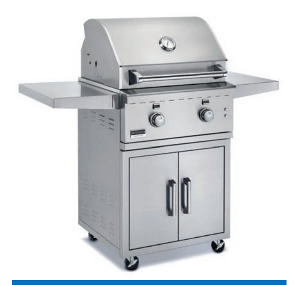
26-IN CART WITH DOORS