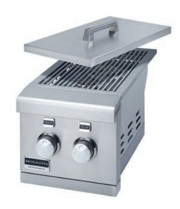
DOUBLE BURNER, SLIDE-IN (12-IN)