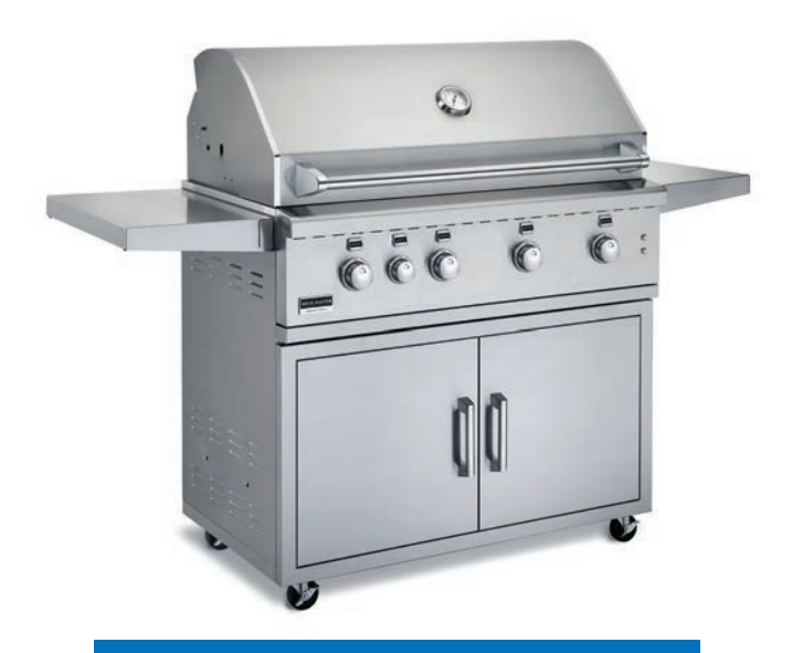
42-IN CART WITH DOORS

Move your grill almost anywhere with one of our cart options. These durable stainless steel carts come in three sizes and include two soft close doors for easy storage. Side shelves provide additional food prep space, and fold down for convenient storage when not in use.