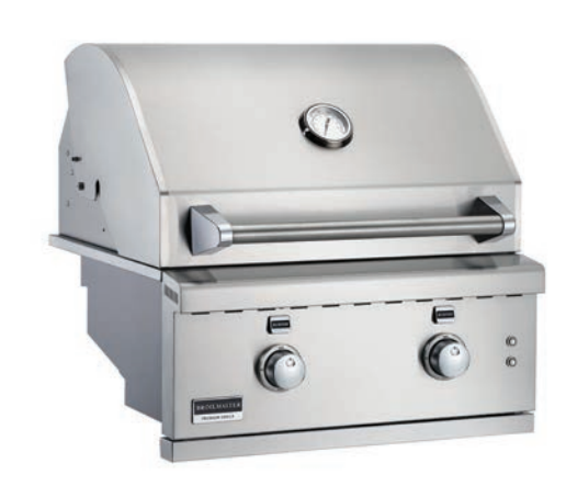
26-IN (TWO BURNER) - 36,000 BTUs