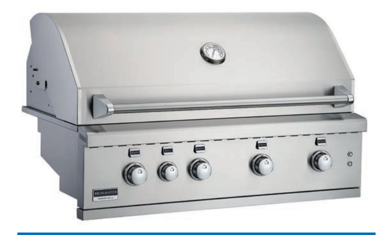
42-IN (FOUR BURNER) - 72,000 BTUs

We designed a wider, deeper grill to maximize your cooking experience. Every Broilmaster Stainless Grill comes fully loaded with a variety of standard features, offering both convenience and versatility. With the ability to roast, sear, smoke, grill, or bake, and numerous features for convenience, the Broilmaster Stainless Grill is the only grill you'll ever need.