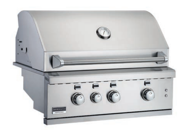
34-IN (THREE BURNER) - 54,000 BTUs